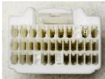
ECU E Plug